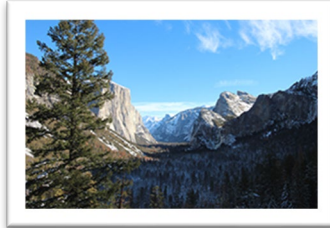
Tunnel View off Hwy 41

Not just a great valley, but a shrine to human foresight, the strength of granite, the power of glaciers, the persistence of life, and the tranquility of the High Sierra. Top Things to Know