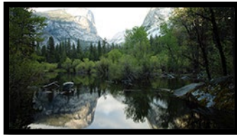
Mirror Lake in Yosemite Valley

Then, apply sunscreen over all exposed skin, including the back of your neck. Sunglasses will protect your eyes from being burned and polarized lens will help you see views more clearly. Don't forget you are 4,000 feet closer to the sun than at sea level. Purchase sunglass straps if you plan to be on the water- it can be frustrating watching your new sunglasses float down the Merced River without you.