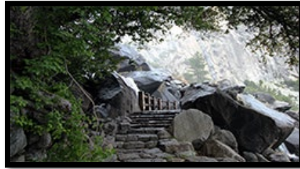
Wapama Falls, Hetch Hetchy Area