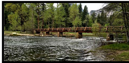
Hanging Bridge in Yosemite Valley

Don't miss seeing the rock climbers on Half Dome and El Capitan or one of the park's 500 bears tromping through a meadow. Bring along a good pair of binoculars to see it all. It's worth talking to your local camp store employee about the different types of binoculars for sale as not all are created equal. You don't want to end up with an extraordinarily weak pair, nor a pair too heavy to hike with. The Nikon Monarch series offers some great features.